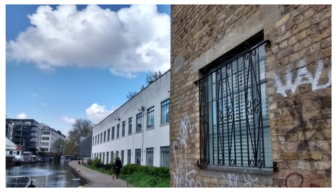
Image 3: View of the south-eastern elevation from the Regent's Canal Footpath