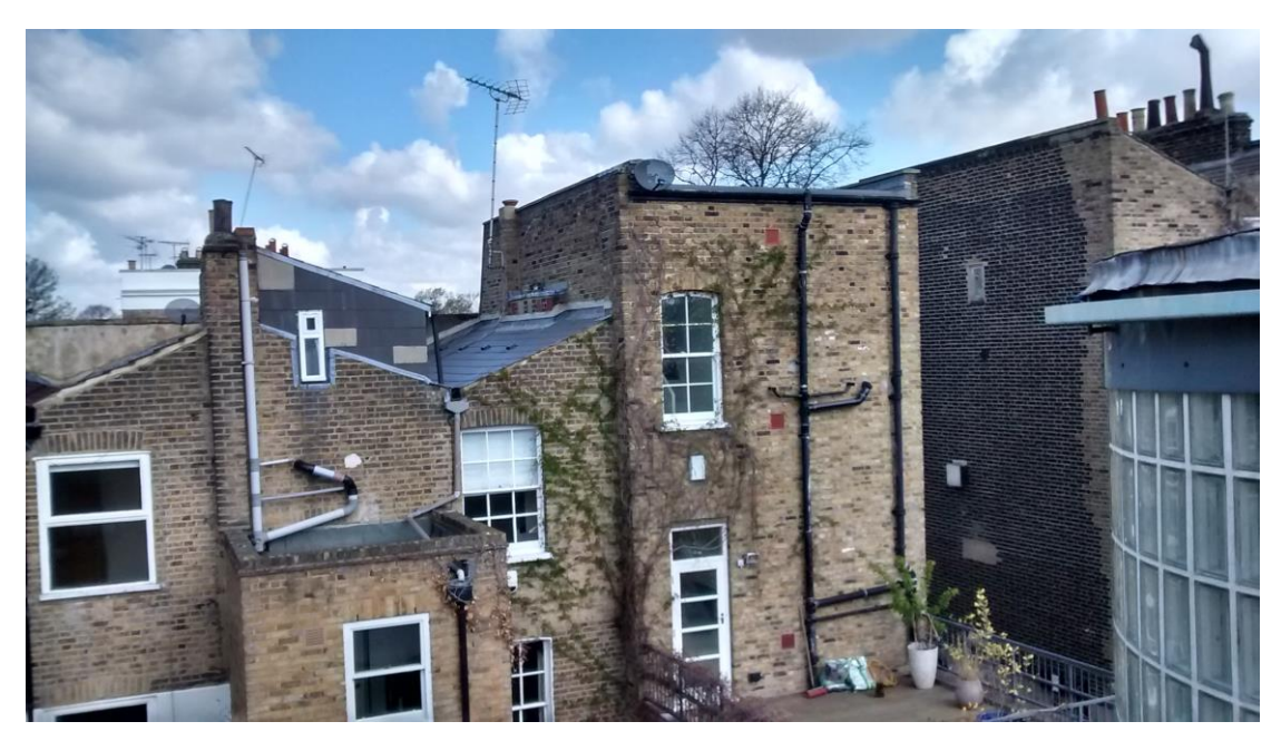
Image 4: View from roof terrace toward properties at Arlington Avenue